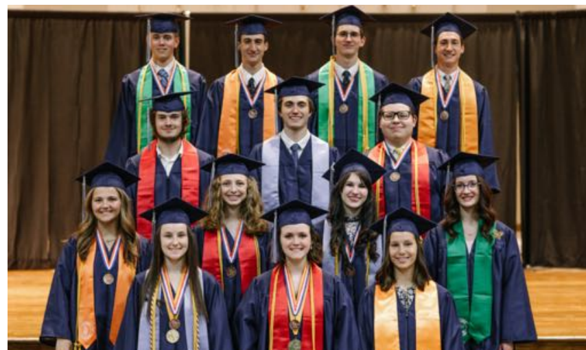
NCS Class of 2023